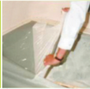
Bath Tub ▶