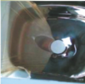
◀ Stainless Steel Sink